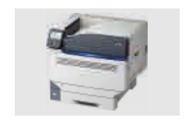
OKI PRO9541WT MAX: A3XL/12.5x19"