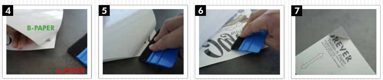
Use a squeegee, ruler or something similar and push the B-Paper backing paper away by rubbing over the B-Paper. Now the glue is applied and the tattoo paper is ready for transfer.

Place the A-Paper face up on a flat surface. Now stick the exposed piece precisely on the corner of the A-Paper.