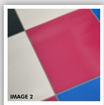
Using "USERTYPE 1" with the correct profiles installed prints even and smooth images.